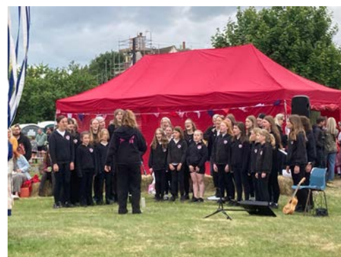
JFR at Iron Acton May Day celebrations