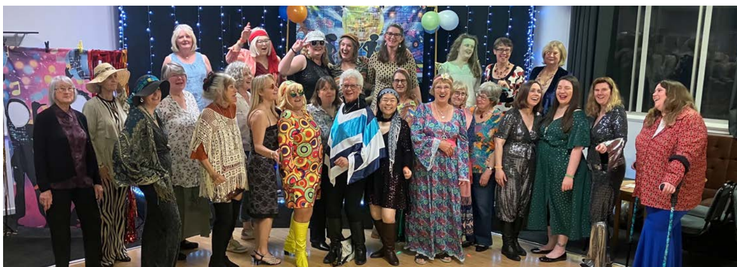
Avon Harmony: Past and present members