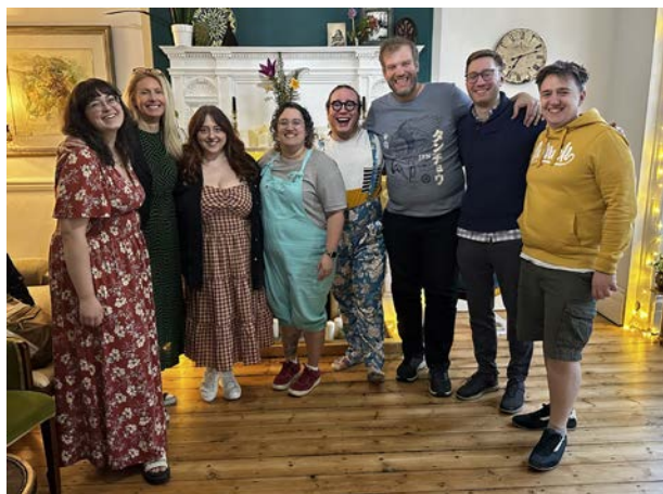
Smoke Ring and The Light Fantastic Quartet

We've been working harder than ever, preparing to represent LABBS on the international stage. Right now, we're focused on two huge events: the European Barbershop Convention (EBC) in Sweden and the Barbershop Harmony Society (BHS) International Convention in July. It's such an honour to be heading into these competitions, and we're giving everything we've got to be ready.