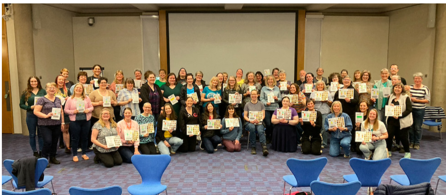
Harmony Hotshots: Sang with everyone from the other voice parts