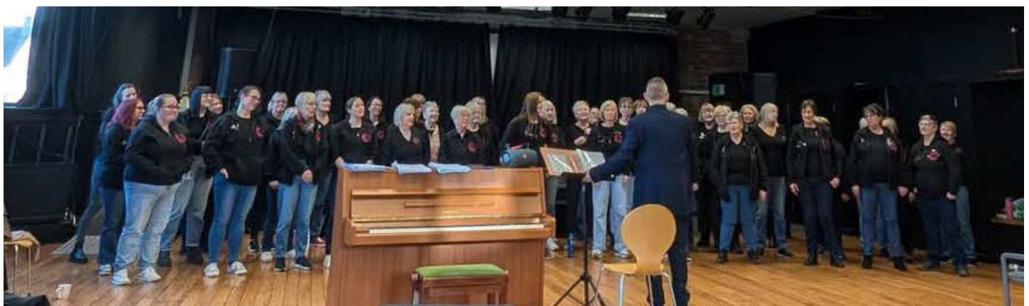
The Red Rosettes in Morecambe