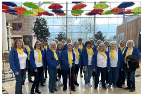
Junction 14 at UK Choirs Sing for Ukraine

On Thursday 3rd April we took part in the UK Choirs Sing for Ukraine event