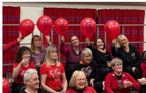
Mayflower A Cappella Chorus celebrating joining LABBS