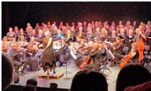
I Am Woman Concert

The following Saturday, 15th March, we took part in Milton Keynes Festival of the Arts at The Venue Theatre