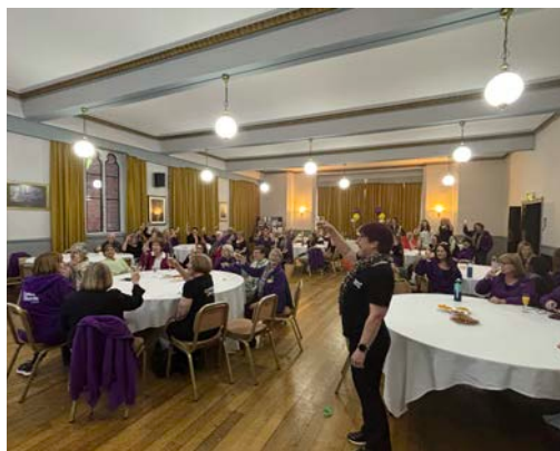
Raising a glass to the next 45 years!