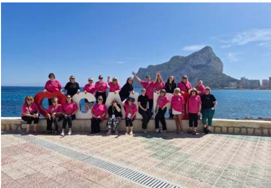
Enjoying the sun in Calpe

The planning and preparation was definitely worth it for a magical