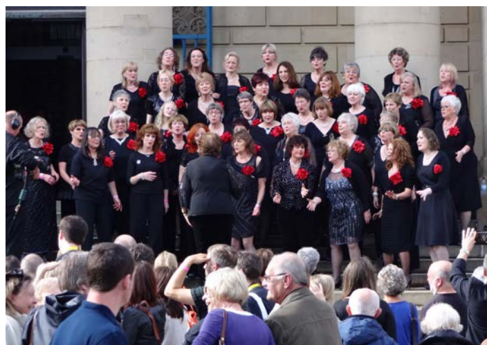
Sheffield Harmony Pulp documentary performance