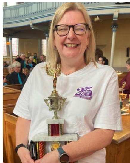
A happy MD!

Returning to the UK with our medals we had no time to relax as we were competing in the Northampton Music Festival four days later. So, with a group of 27 we performed again. This time we were thrilled to come first and receive another trophy to bring back to our rehearsal space.