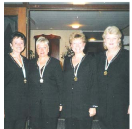
No Strings quartet