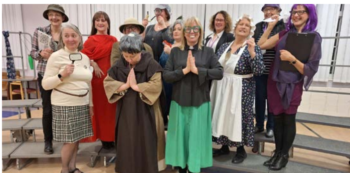
Murder Mystery Night: Who's that lurking in the centre of the back row?