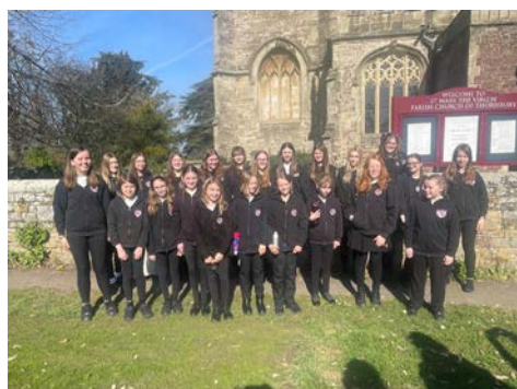
JFR at Eistedfodd

showing at this year's Thornbury Arts Festival, performing in the Under 18s Choir Class on 20th March. Their lively rendition of Wellerman and a beautifully controlled performance of Billie Eilish's What Was I Made For earned them 87 marks and an Honours award.