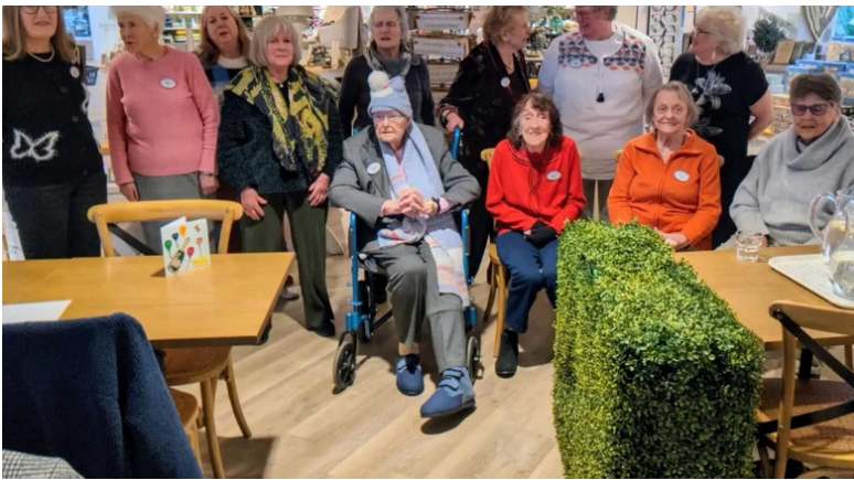
9-5 at the garden centre