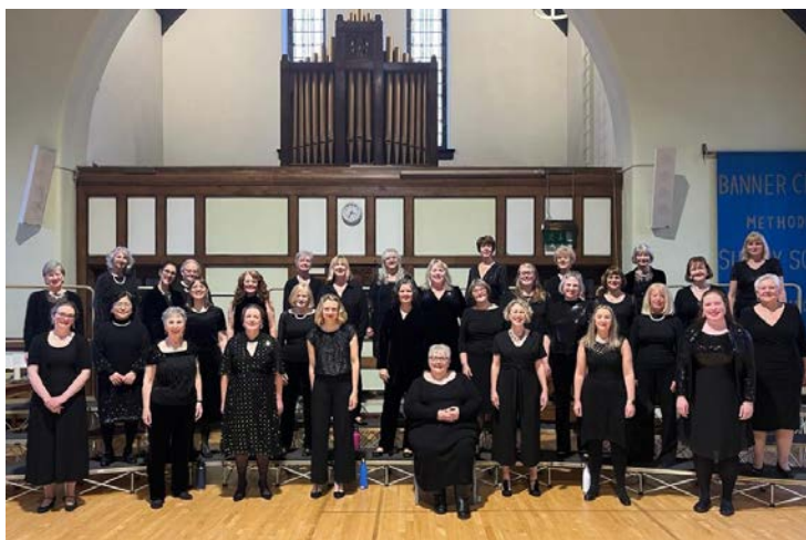
Sheffield Harmony Christmas concert 2023

In 1995, Sheffield Harmony adopted their current name as they moved to Sweet Adelines, after a brief stint as the Don Valley Chorus. Over the next few years they threw themselves into competitions in the UK and overseas. They also thoroughly established their place in the Sheffield cultural scene, even featuring in a documentary in 2012 about local music icons Pulp, where they performed a cover of Common People on the steps of the City Hall.