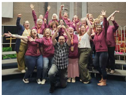
Six Town Sound, buzzing!

after a truly unforgettable trip to Calpe, Spain, where we hit the international stage at the BIBA Convention and came home with silver medals and a result that went beyond what we'd dared to dream – an 82%! It was a weekend full of sun, song, shared passion, and a performance that marked a real step up for us as a chorus.