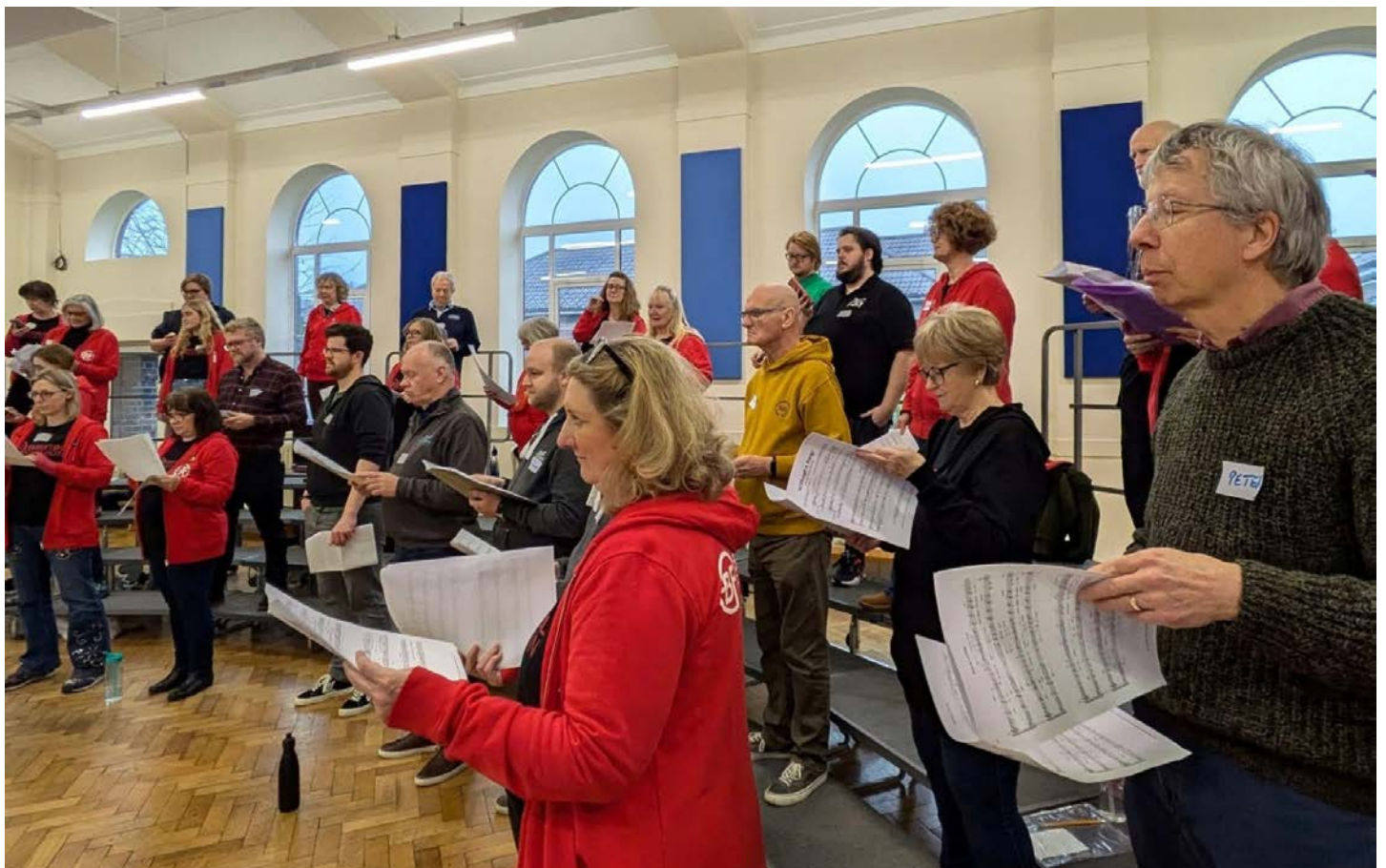
Riser Buddies: GWC and BF