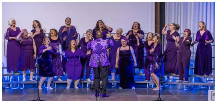
On the international stage at BIBA