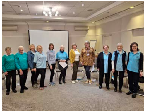
Participants at the retreat

In early March , shaking off those winter blues, Coasties and friends, with live-streamed support from members unable to travel, once again enjoyed a fabulous weekend of singing and friendship in Leicester's Hilton Hotel.