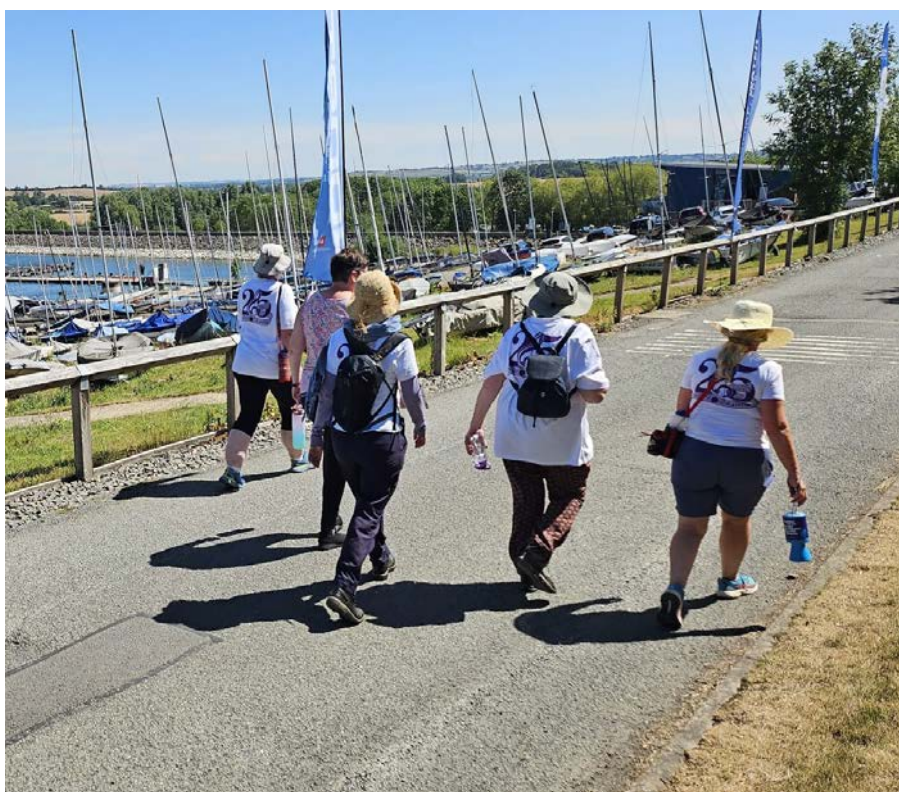
Silver Lining walkers