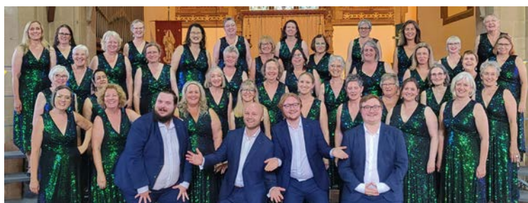
Harmony InSpires and In the Wings

Volunteers from Harmony InSpires threw themselves into organising the raffle, the proceeds of which helped to boost chorus funds, as well as