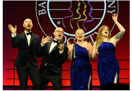
The Sharrow Vale Blues