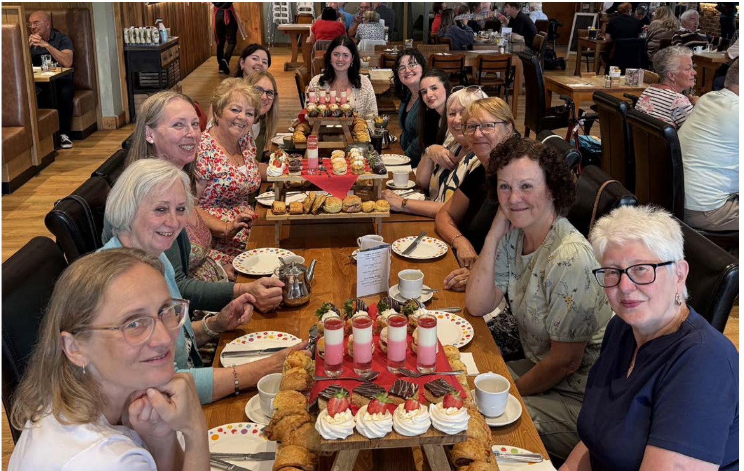
We enjoyed an 'ansom celebratory afternoon tea