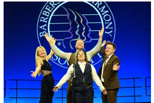
The Light Fantastic

Beyond the competition, what made this week truly magical was the sense of