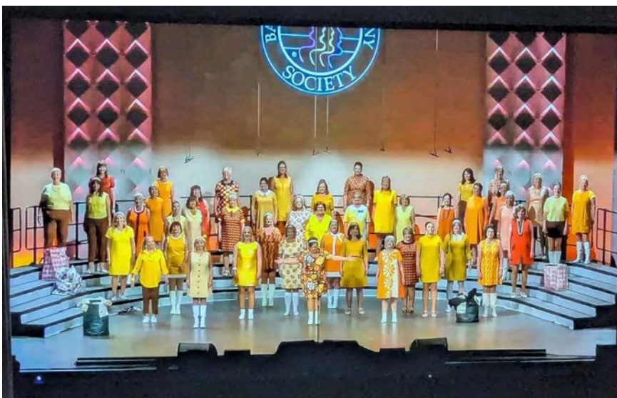
Bringing the 60s to Denver