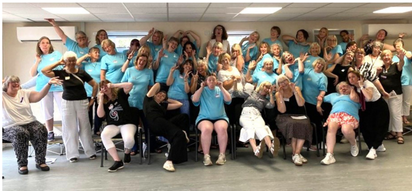
Fun with The Barberettes