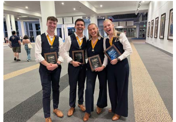
Ami Quartet with their awards