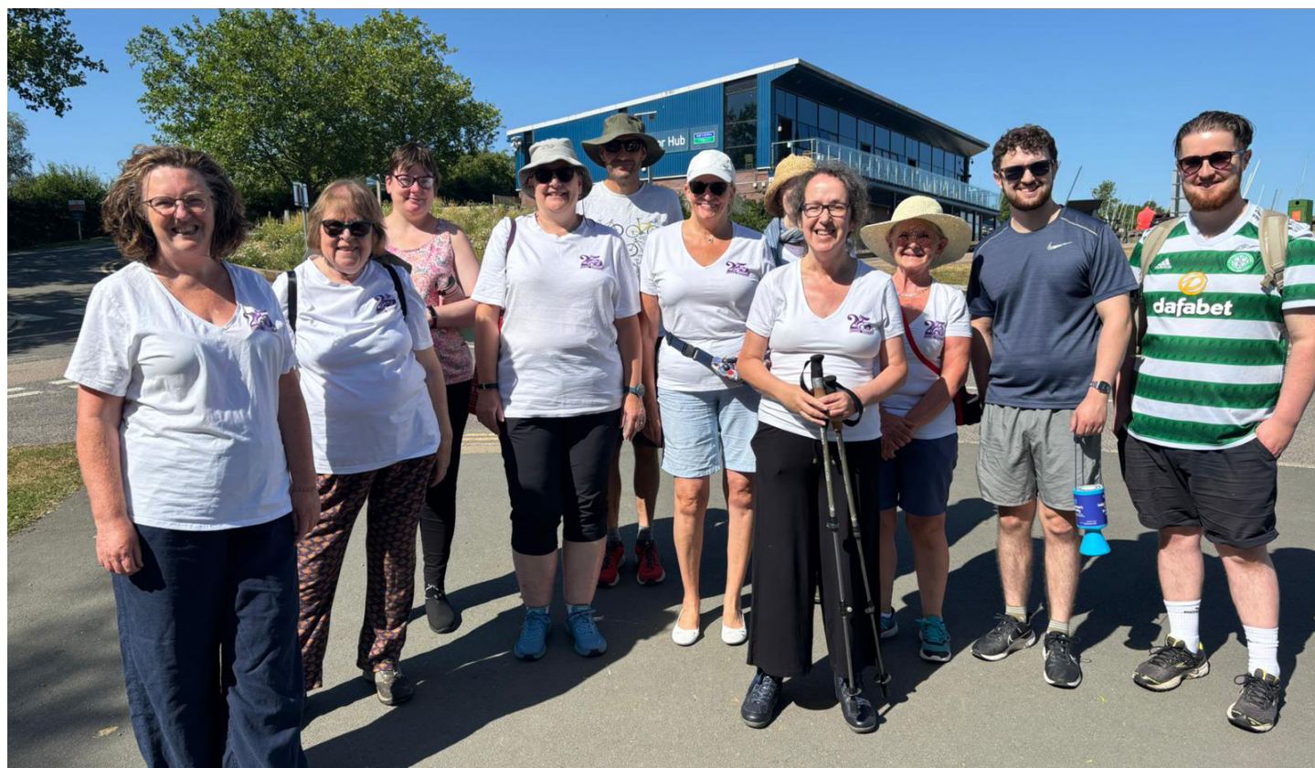
Silver Lining Support Team