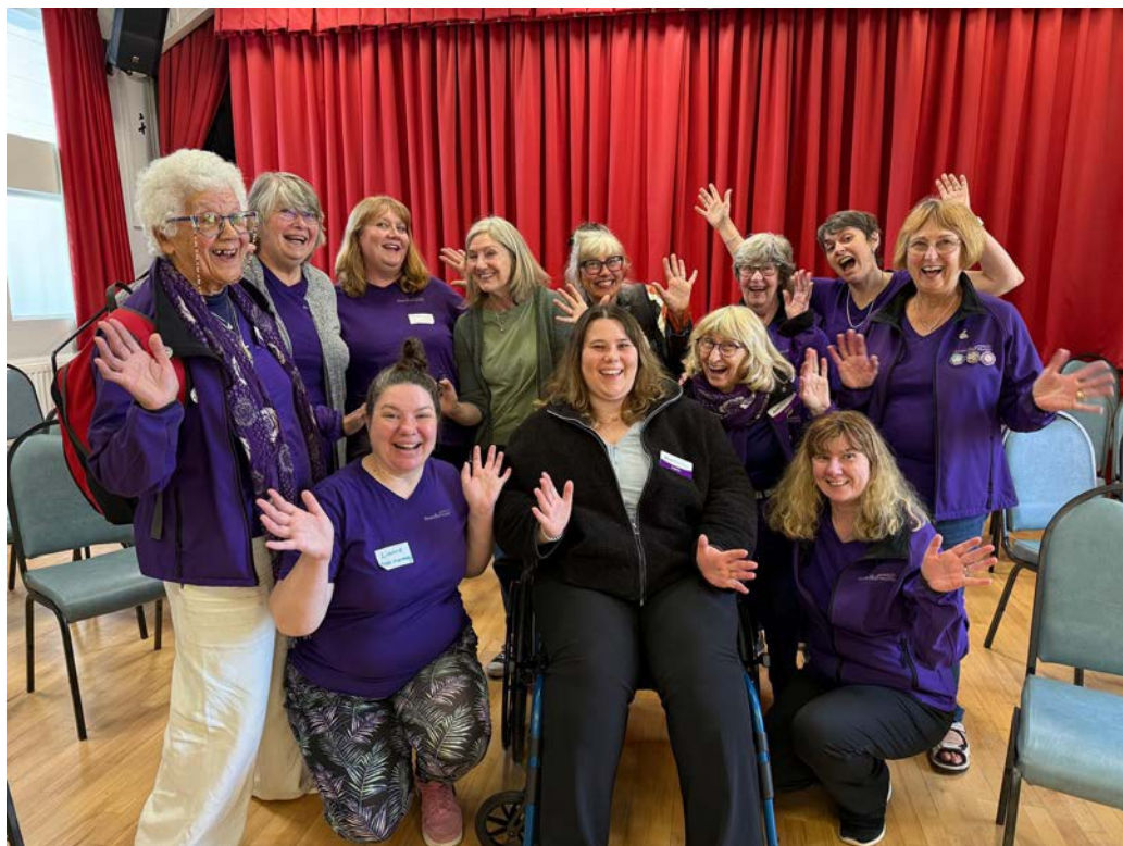
LABBS Education Day

Most recently, we had a fun and fulfilling day welcoming The Barberettes (also a LABBS founder chorus) to join us in Bristol for a founder's workshop. Together we sang a LABBS polecat, Bohemian Rhapsody , and the four part Friends theme tune. We also supported each other's performance sets, did