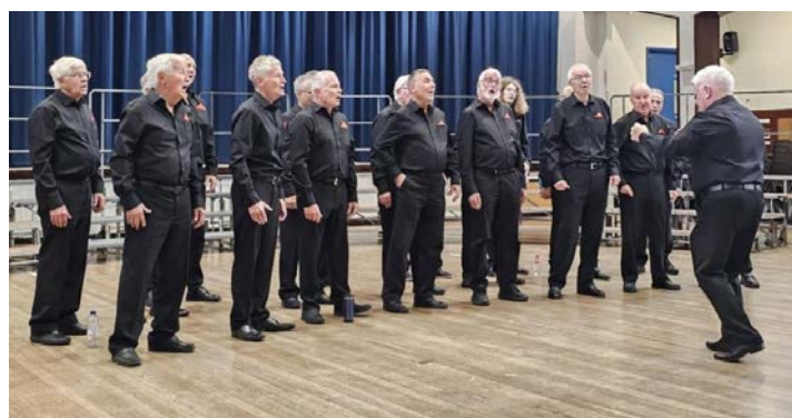
Solent City Chorus celebrating their 50th anniversary