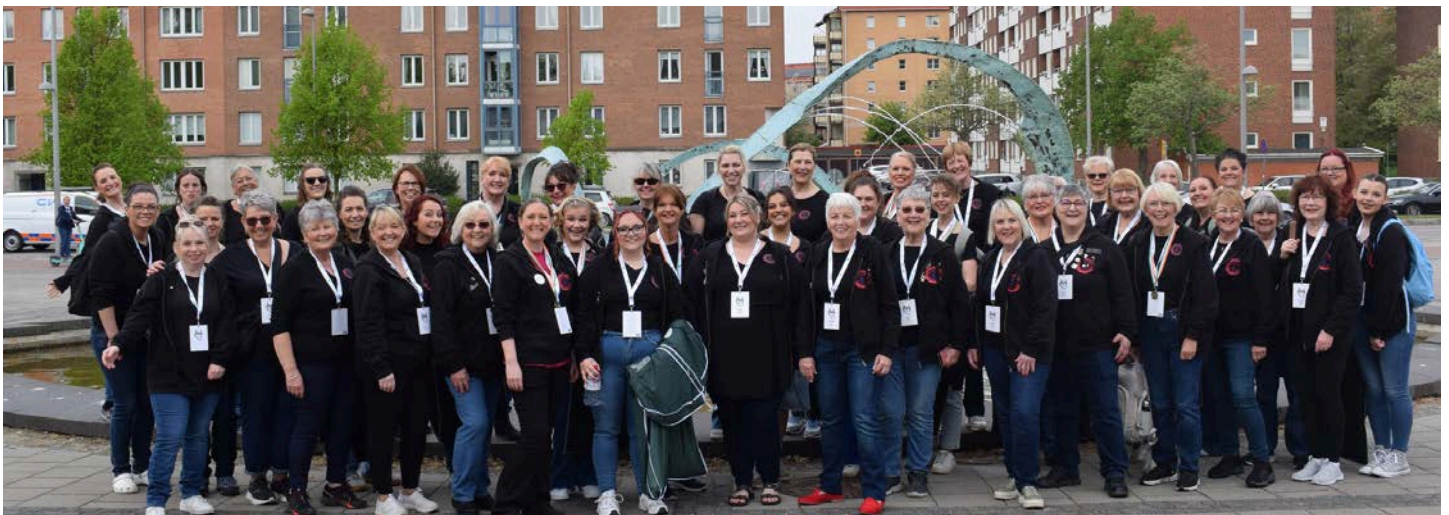
The Red Rosettes at SNOBS