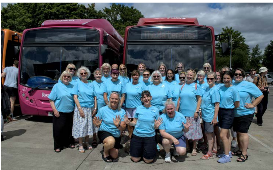
The Barbs on tour. Check out our personalised Barberettes bus!

I'm delighted to report that The Barberettes delivered some remarkable performances, securing two second places and a fifth place in three different categories. We were also voted the friendliest and most energetic choir by the staff and audience members. As