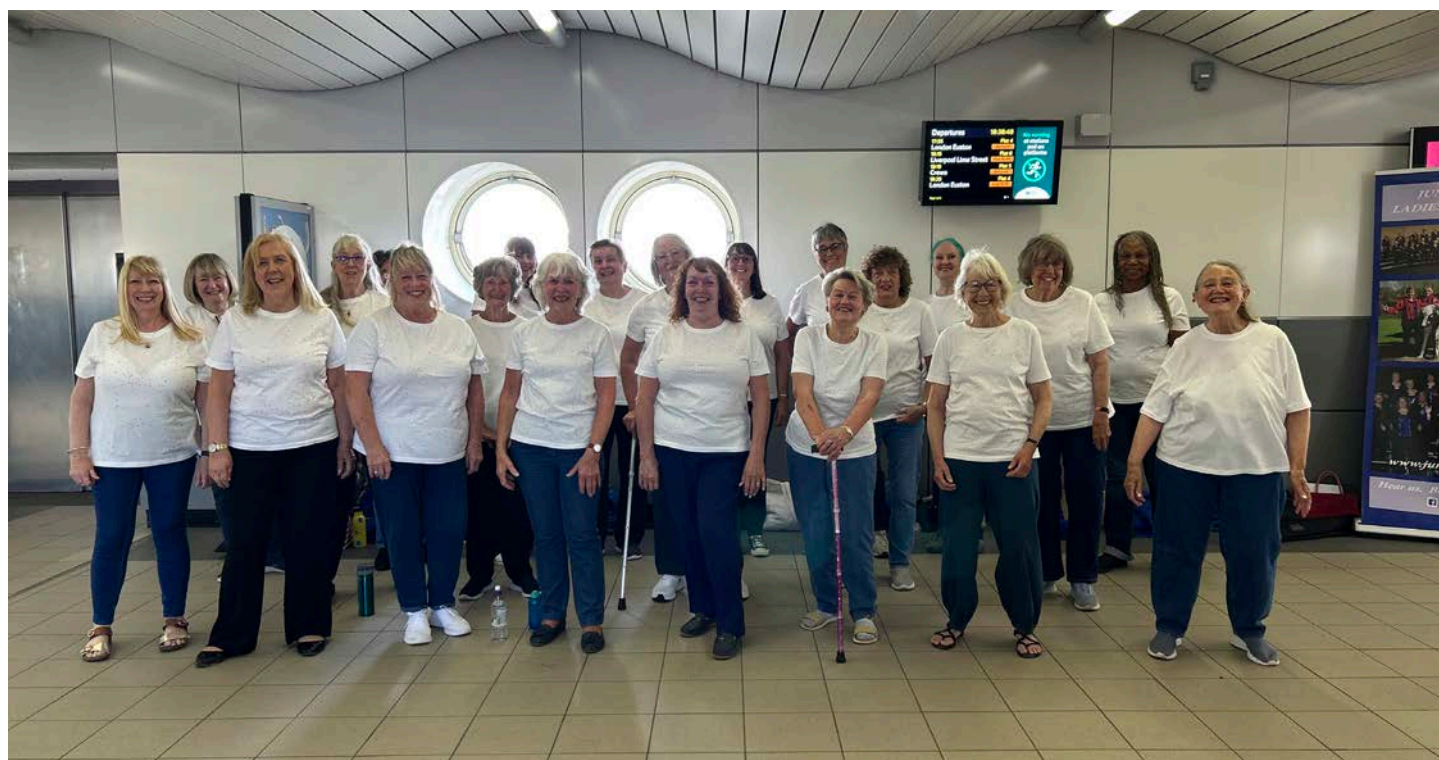
Our favourite venue: the Concourse at Milton Keynes Railway Station