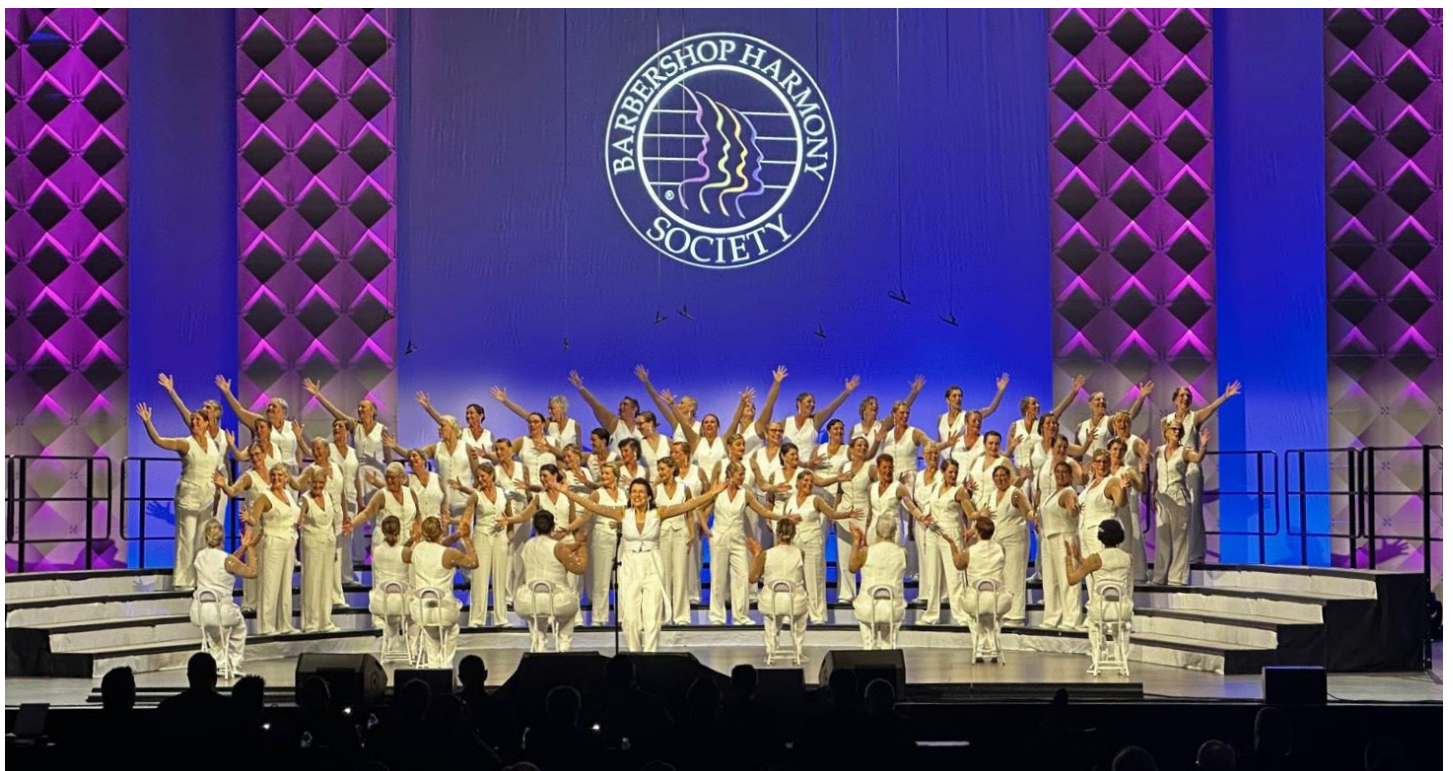
Amersham A Cappella on stage