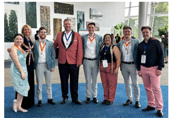
Hot Ticket and The Light Fantastic

As a quartet, we took advantage of many performance opportunities outside of the contest stage. Firstly, to represent the UK performing God Save The King with our friends The Light Fantastic, was such a joy; we shared this session with friends in Primer and Hillbillies who represented Sweden, and Ceoltóirí Canóla who represented Ireland. Open rehearsals are a great way to spend time at BHS International: we soaked up the rich chords and knowledge of Central Standard chorus who kindly let us sing two songs for them, and we spent time with the spectacular Parkside Melody chorus for whom we debuted a new arrangement that we had commissioned. Finally, a dream came true as we performed in the fabulous Rainbow Room during the Saturday