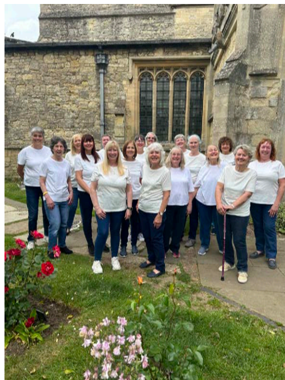
Junction 14 at St. Laurence Church

July was busy for us too. We sang at the Milton Keynes Community Choirs Festival in Campbell Park, along with 15 other choirs. A great event and the sun shone all day! We had another performance for a Golden Wedding Anniversary party and a garden party to attend too.