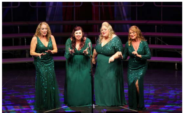
Fifth & Madison