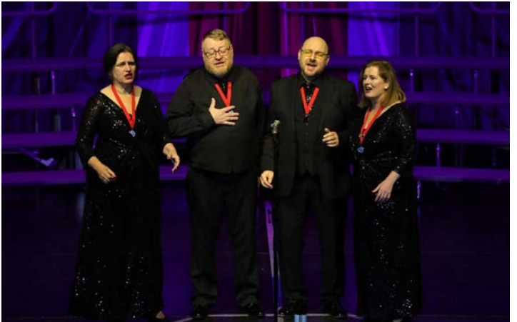
Mixed Silver Medallist Quartet, Powerhouse