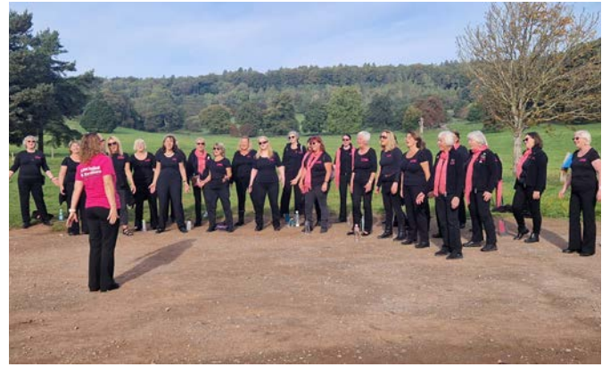
Singing for St Peter's Hospice