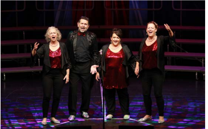
Mixed Bronze Medallist Quartet, Jam First