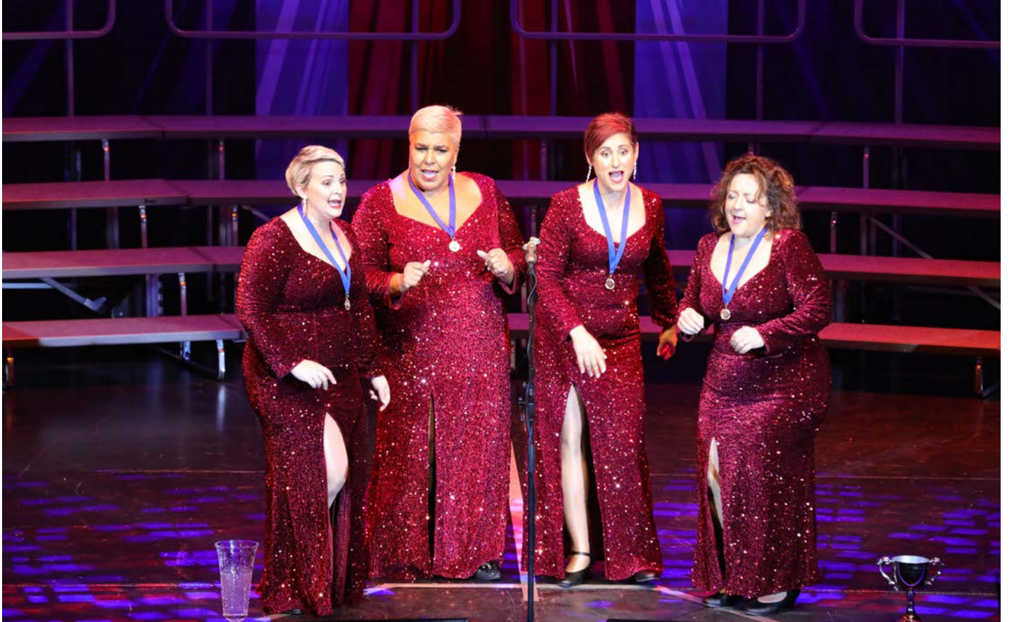
Women's Gold Medallist Quartet, Barberlicious. Recipients of The LABBS Champion Quartet Trophy, The Indigo Blue Trophy, and The Pzazz Trophy