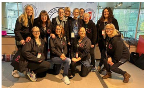
Red Rosettes at the First Timers Desk

We were singing for the first time in four years, with 13 newbies and two unborn babies on board, and we absolutely loved it. Our newbies were blown away by the love and support of the whole LABBS community, thought the Afterglow was amazing, and were spoiled for choice on who to sing with. They also commented that they didn't realise how emotional it would be, and loved Sing with the Champs and the Mass Sing. I think they may stick around!