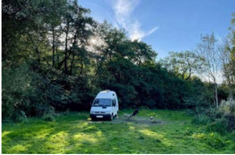
Camper Van - the start of STS

Six Town Sound are really excited to have joined LABBS as new members this year. We've had an absolutely brilliant first year as a chorus and can't wait to see what our future and membership of LABBS has in store for us.