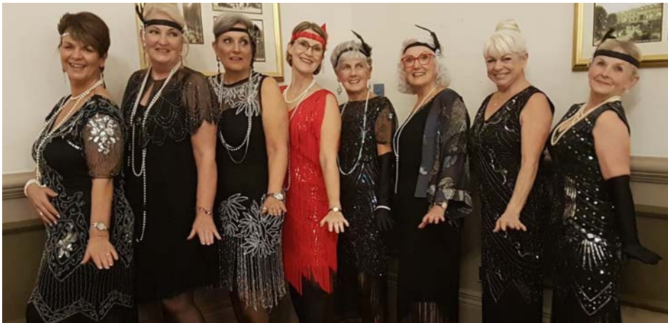
Ladies that do tea in style