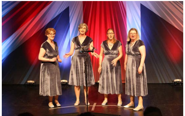
Specs Appeal, recipients of The Jen Mills Award