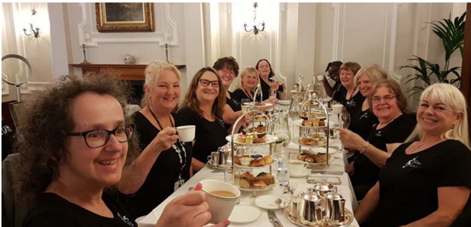
Some, but not quite all, of the Basses at Betty's