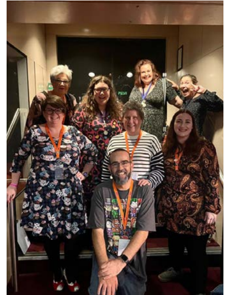
STS at Convention

We've come a long way in just 12 months and can't wait to see where we're going! We're now looking forward to ending our busy year with a free festive open event – see our Facebook page for details . If you or anyone you know is near one of Stoke-on-Trent's six towns, please come and join us!