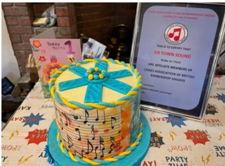
Happy Birthday Cake and Welcome Certificate