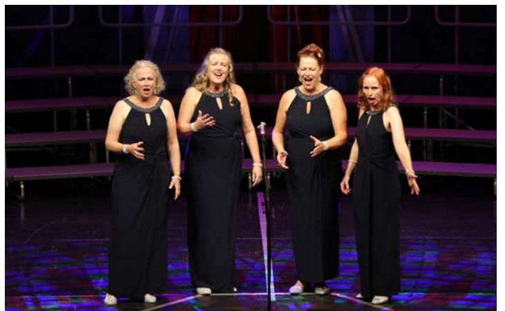
Treble in Paradise