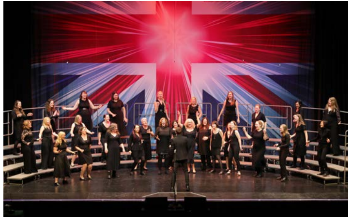
London City Singers