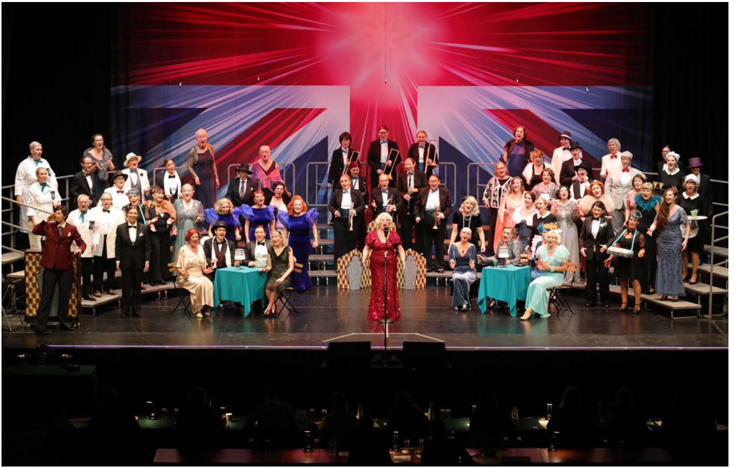
Gold Medallist Chorus, Cheshire Chord Company. Recipients of The Brighton Rose Bowl, The Peter Caller Award, and The Music Trophy