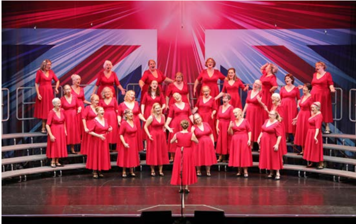
The Belles of Three Spires