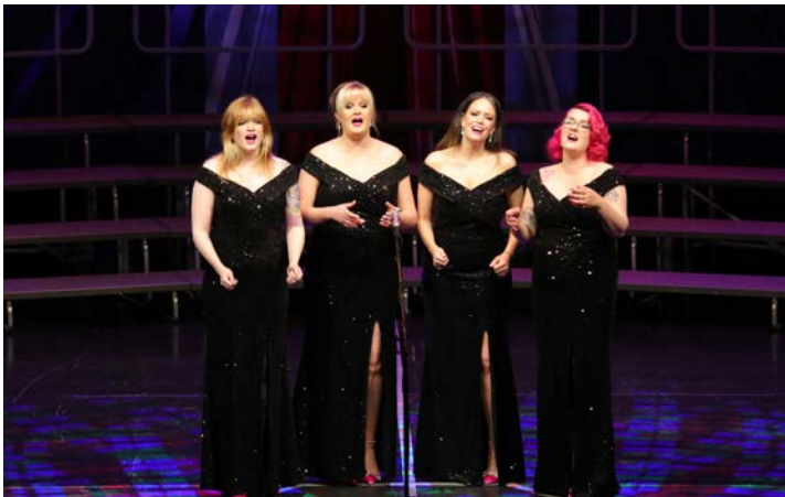
The Bakewell Tarts