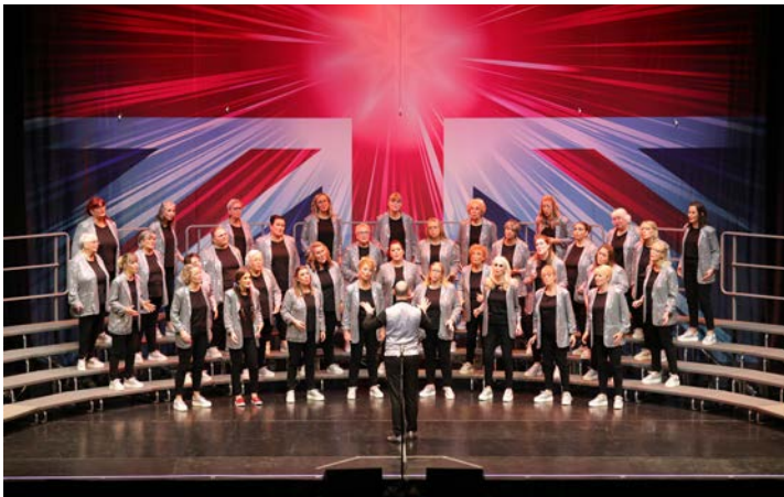
Affinity Show Chorus