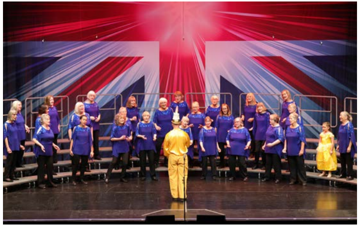
One Accord, recipients of The Harmony InSpires Trophy