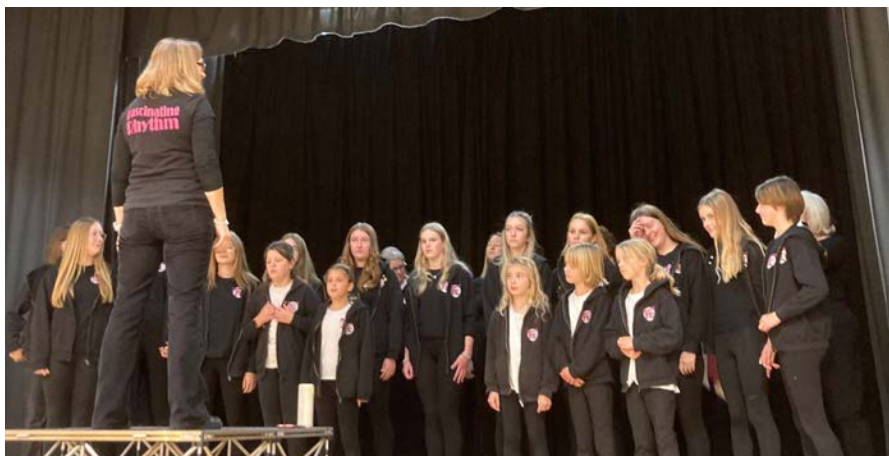
Junior Fascinating Rhythm sing at FRs table top sale