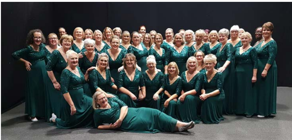
Our fabulous new dresses - we love them!