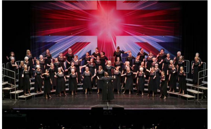
The Red Rosettes