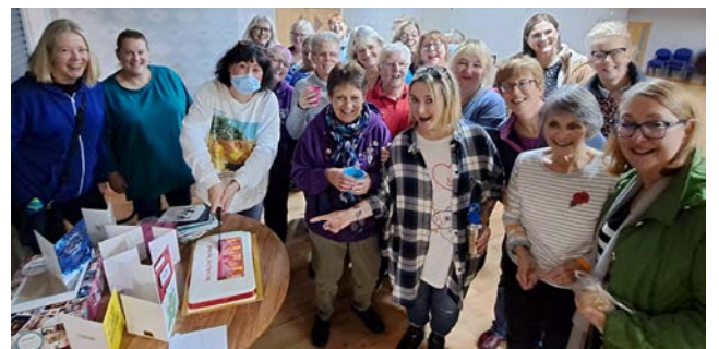
GEM Connection's cake