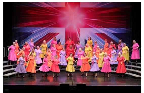
GEM Connection, back on the competition stage