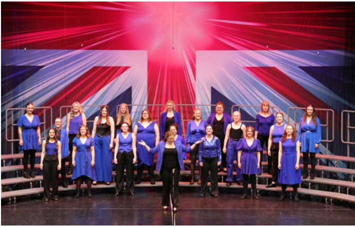
LABBS Youth Chorus, recipients of The Phoenix Trophy