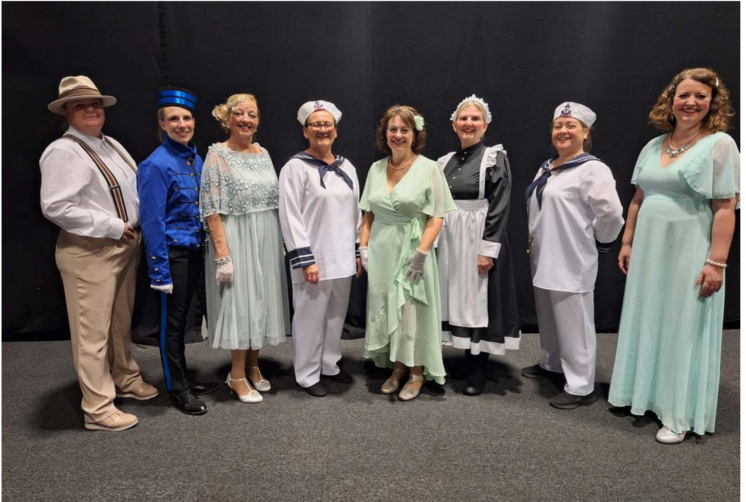
New members, ready to board the SS Spinnaker.