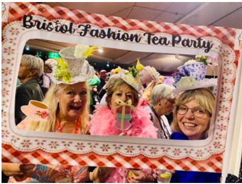
Bristol Fashion: Ready to Tea Party!

So, a 'Love to Sing' course complete with newbies was our theme – perfect! After all, it's how many of us found our way