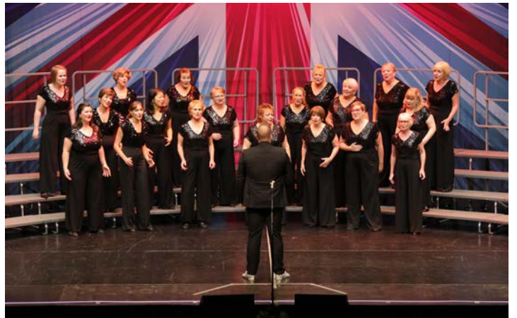
Signature A Cappella