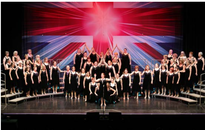
The White Rosettes