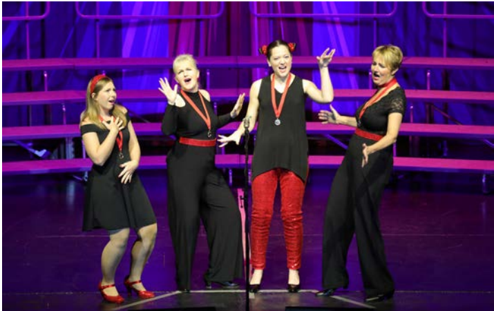
Women's Silver Medallist Quartet, Muddy Stilettoes. Recipients of The Holland Harmony Trophy, and The Crackerjack! Trophy