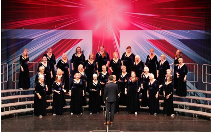
Main Street Sound