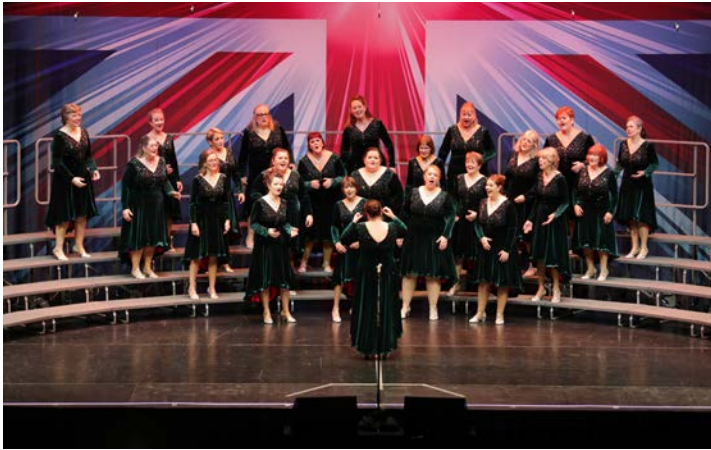
A Bunch of Roses