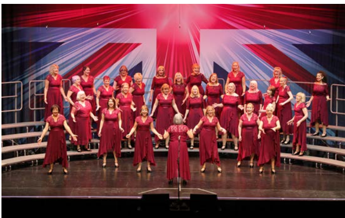
Cheshire A Cappella