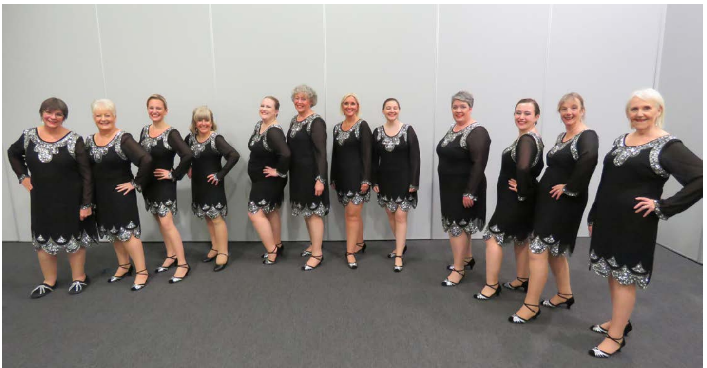
The Abbey Belles First Timers