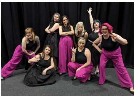
Shenanigans and The Bakewell Tarts

We didn't believe Emma when she read out the Prelims results and said that we'd come seventh, but with four months to get used to that fact, we'd spent the time preparing to give our very