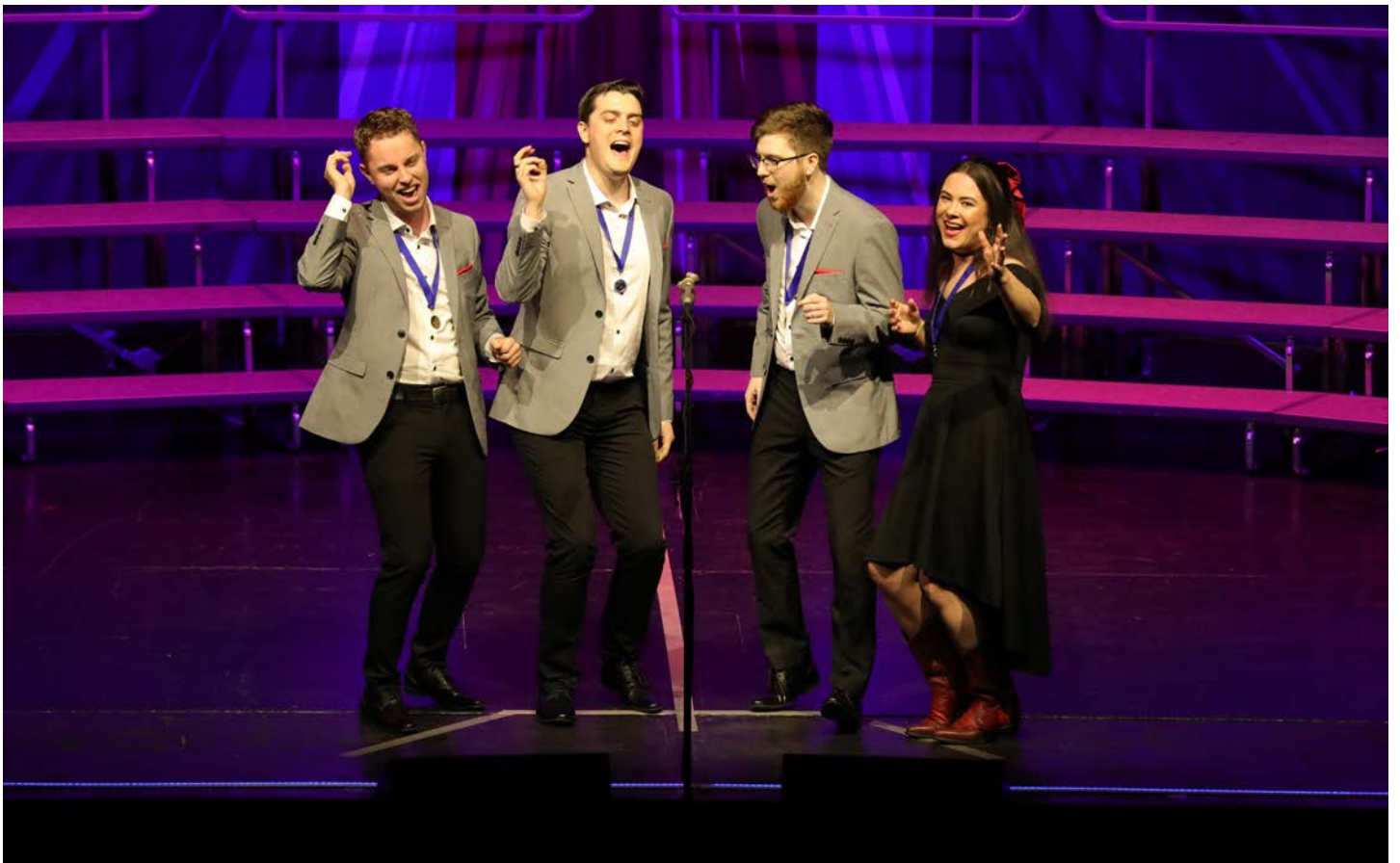
Mixed Gold Medallist Quartet, Hot Ticket