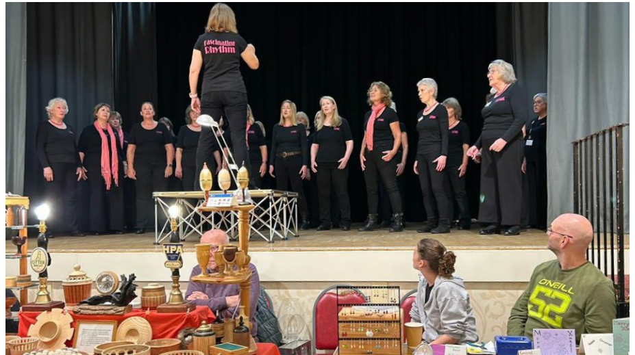
FR at their table-top sale

It was the infusion of melodious entertainment that truly set the sale