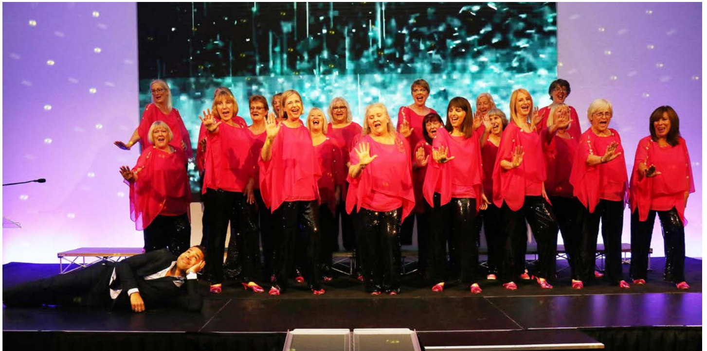
Pride 2023 - It's Raining Men