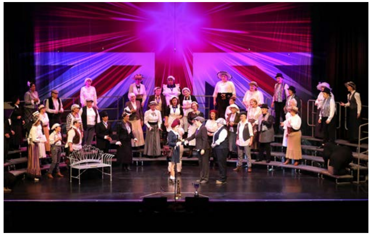
Bronze Medallist Chorus, Crystal Chords. Recipients of The Harmony, Incorporated Trophy, The Westering Trophy, and The BABS Entertainment Trophy