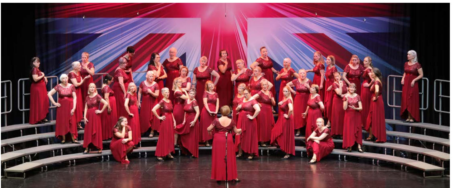
Harmony InSpires on the stage in Harrogate