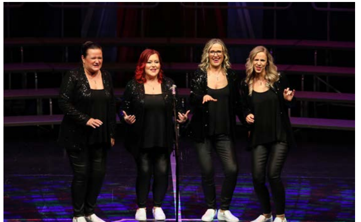
The Rolling Tones