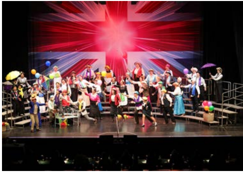
Crystal Chords on stage

After the most amazing weekend in Harrogate, we are still on a high, polishing our medals and trophies!