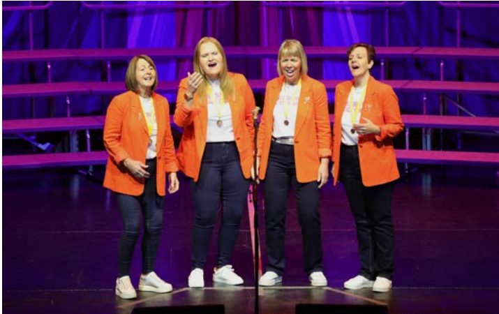
Women's Bronze Medallist Quartet, Northern Soul. Recipients of The Guildford Harmony Trophy