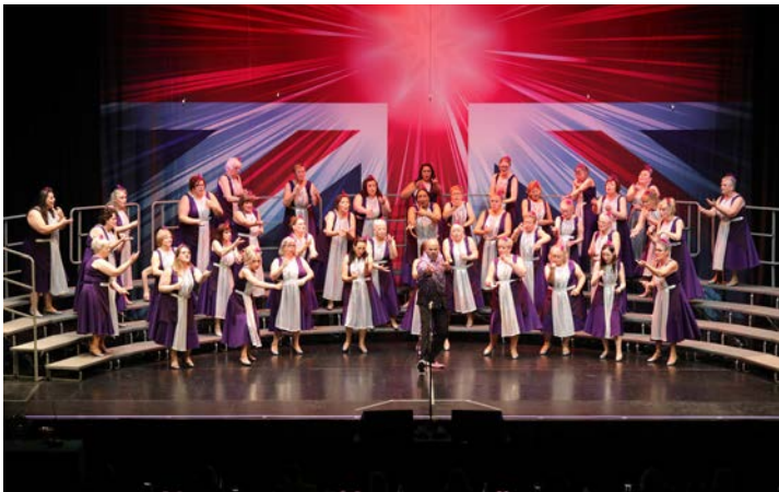
Second City Sound